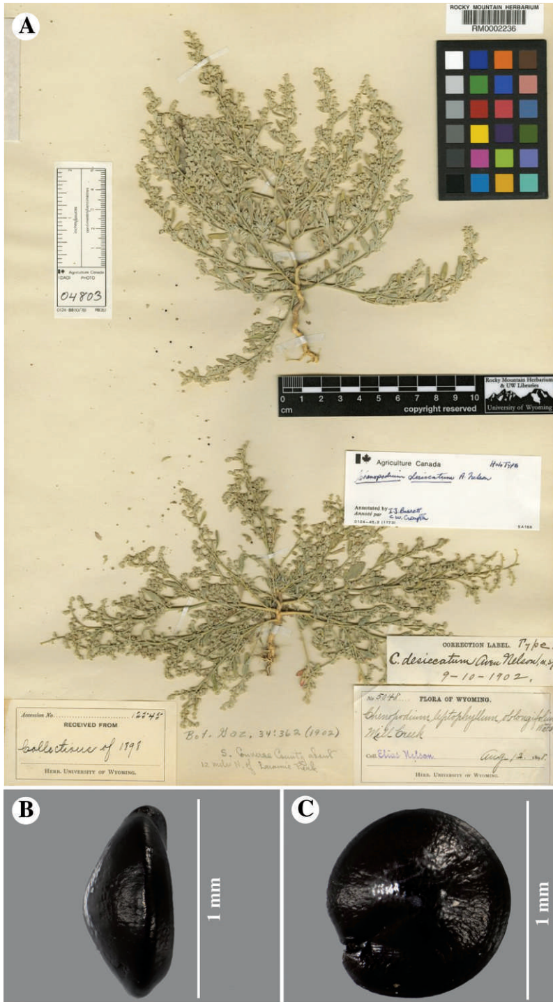
FIG. 1. A. Holotype specimen of Chenopodium desiccatum (E. Nelson 5048, RM 12545, barcode 0002236!). Note profuse branching. B–C. Seeds of Chenopodium desiccatum , from co-type specimen (J. H. Cowen s.n., RM 8460, barcode 0002235!), in side (B) and face (C) views. Note that seed is basally conical, apically flat.