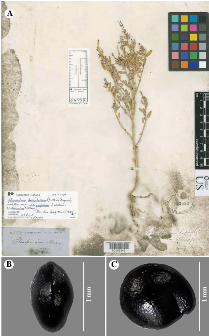
FIG. 2. Lectotype of Chenopodium leptophyllum var. oblongifolium [ C. oblongifolium (S. Watson) Rydb., ined.]; C. Wright 1732, 1851–1852 (US 43922, barcode 00102549), designated by Bassett and Crompton (1982). A. Herbarium specimen. Note erect stem and branching pattern. B–C. Seed in side (B) and face (C) views. Note seed morphology different from C. desiccatum .